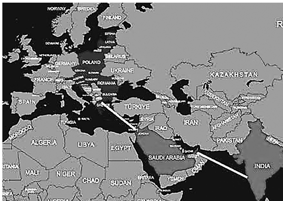
Figure 3. India-Middle East-Europe Economic Corridor

The case study is the India-Middle East-Europe Economic Corridor – IMEC (Figure 3), one of the most significant economic projects currently underway in the Middle East, to be adopted in New Delhi in November 2023. It will enable faster and more efficient transport of goods between India, the United Arab Emirates, Saudi Arabia, and through a developed rail network with the remaining GCC countries, Jordan, and Israel, providing direct access to Europe, Greece, and the Three Seas Initiative countries. Saudi Arabia and the United Arab Emirates are trying to secure their key trade and energy corridors from potential disruptions. The Middle East could become an essential global trade hub if it manages to overcome political and security challenges, including those