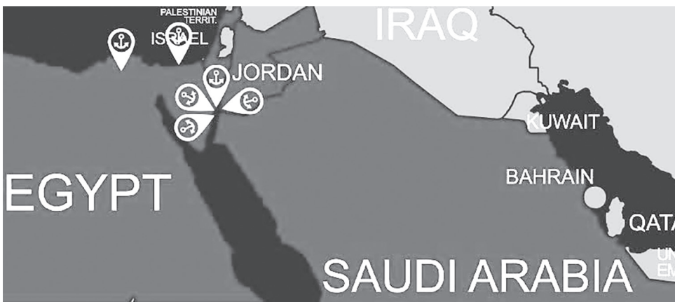
Figure 4. Sea Ports

They are therefore the subject of various international and neighbouring entities and new initiatives. One of these is the multimodal Arab Trade Line, a transport route connecting the port of Aqaba in Jordan with the port of Nuweiba in Egypt, extending overland to the port of Alexandria, and providing a link between the Red Sea and the Mediterranean (Northern Africa News, 2023). The project is expected to eliminate the need for some Jordanian exporters to use Israeli seaports. In addition, Egypt's plan to build a port in Taba, a southern Sinai city that overlooks the Gulf of Aqaba, would transform Sinai into a central logistics hub and a significant trade flow between the Red Sea and the Mediterranean, providing an alternative to the Ben Gurion Canal plan. This Taba, once expanded, would be located about five nautical miles from Eilat, Israel's only seaport on the Gulf of Aqaba, on the Red Sea. It could be a link to the Suez Canal, the shortest route between the Red Sea and the Mediterranean Sea through the port of Arish in northern Sinai (Figure 4), if Egypt builds a railway between Taba